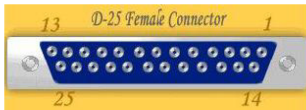
PC Printer Port